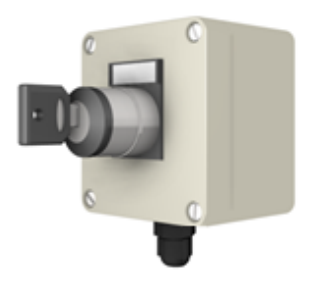
Figure 6 – External key switch

The key switch option offers the same function as the keypad but via a key operated switch. In addition, the key switch does offer 'press and hold' operation. To open the product, turn the key in a clockwise direction. To close the product, turn the key in an anticlockwise direction.