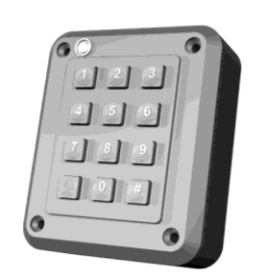
Figure 5 – External keypad

The keypad option offers secure access into the product from the outside via a numerical pass code. To open or close the product, enter the four-digit numerical code (Glazing Vision supplies an initial code with the product and instructions for changing it as required). Unlike the standard internal wall switch, the keypad does not offer 'press and hold' operation. The keypad is mounted remotely.