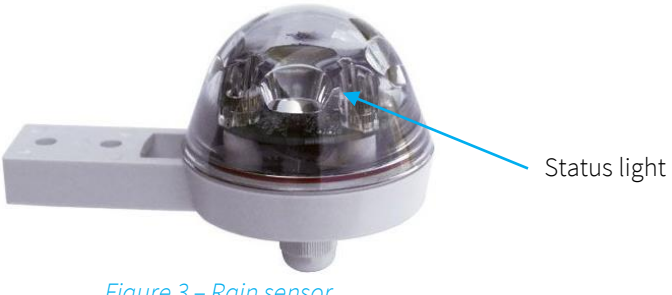
Figure 3 - Rain sensor

The rain sensor automatically closes the product when moisture is detected. When the product is opened it activates the built-in low power heater to evaporate any surface moisture (this will remove condensation/dew but not large amounts of standing water or ice). If moisture is still detected, the product will close on the assumption that it is raining (the status light will illuminate green). The control switch status light will also flash intermittent green indicating a closure due to rain. The rain sensor should be positioned horizontally (in line with the ground) in a location that will ensure that it is exposed to the rain and must be kept clean to function correctly.