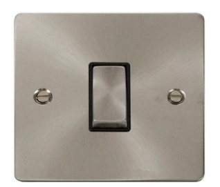
Figure 4 – Rain sensor isolation switch

The rain sensor isolation switch is internally mounted and wired directly to the rain sensor cable, allowing the sensor to be switched on/off. Turning off the switch deactivates the signal from the rain sensor and prevents the product from closing in the event of rain. This avoids the scenario where someone could be shut outside by the rain sensor when it rains. Ensure that the switch is turned back on for normal use.